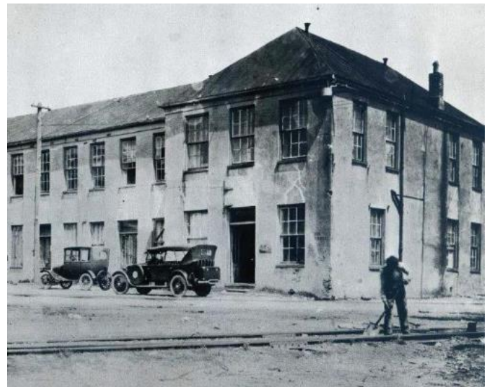
N. Adgers Wharf 1924 with a Lincoln Phaeton and Ford Model T Center Door

Talk with us about our wealth management services. Working together, we can develop a strategy and present customized strategies using our client-first philosophy and resources to help you work toward your financial objectives.