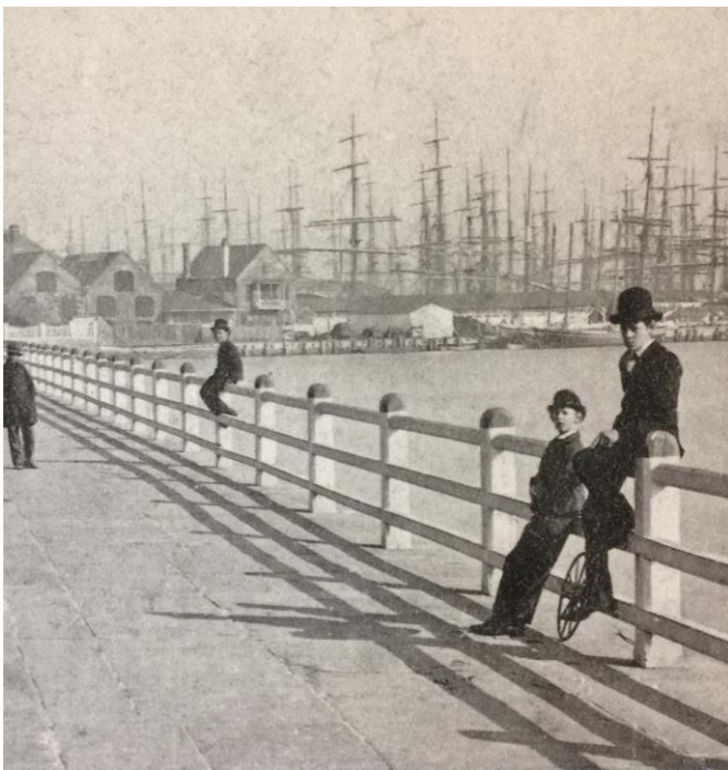
East Bay Street - Battery 1890

This is what it means to be with Nicholson Wealth Management Group.