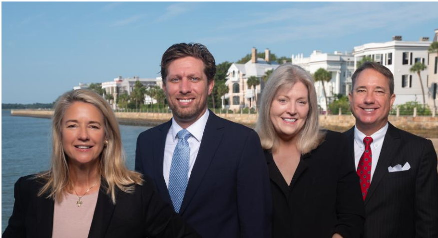
The Nicholson Wealth Management Group

All IWI certified individuals agree to abide by a Code of Professional Responsibility. They also remain up-to-date in their field by completing 40 hours of continuing education every two years.