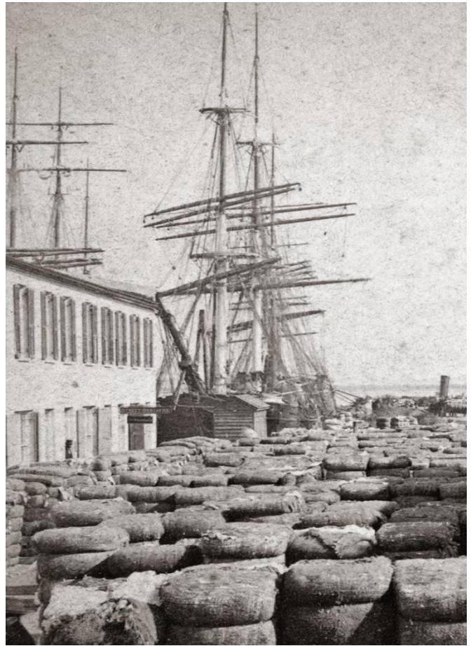
Staging Cotton Bales on N. Adgers Wharf 1885

The Nicholson Wealth Management Group leverages decades of knowledge and applies a disciplined investment management approach with each client to help craft a custom-tailored strategy.